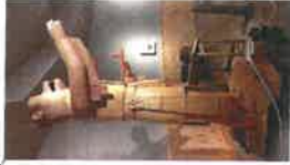
BEAR STATUE WITH LIGHT