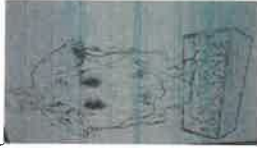
FISHERMAN STATUE WITH LIGHT